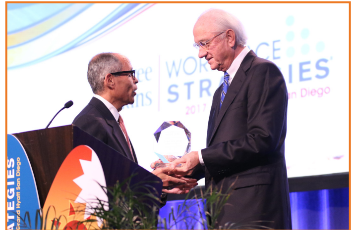
Ogletree Deakins donated $40,000 to Father Joe's Villages, a San Diego-based organization that supports thousands of military veterans and homeless children and adults in the San Diego community.